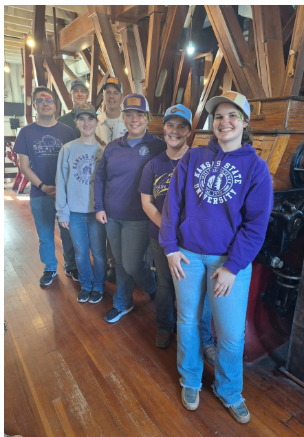
The Museum partners with students and professors in the Kansas State University milling program to provide guided tours of the Old Mill in operation.

If you (or a business or person you know) would be interested in supporting Millfest and the Museum, there are many affordable levels. Event sponsorship details are available at www.oldmillmuseum.org/events/#Millfest . Sponsorship is open to businesses, individuals, and families alike!