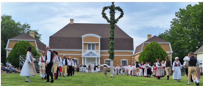
Top left: Perfect Blend Construction added braces and metal straps in the rafter area of the Pavilion. Top right: Installation of shear walls on the north and south side now prevent the dangerous "racking." Bottom: Structural repairs were complete by Midsummer's Festival in June 2025.