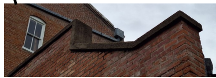
Old Mill Powerhouse -New roof -New parapet wall masonry repair Pending: Exterior walls masonry tuckpointing repair