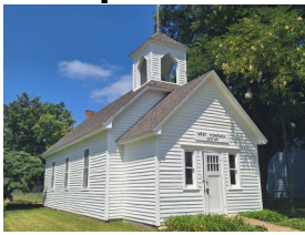
West Kentuck One-Room Schoolhouse -New exterior paint -New roof