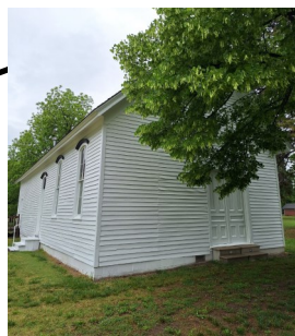
Academy Building -New exterior paint Pending: New roof