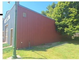
Heritage Center -New north exterior wall and repainting