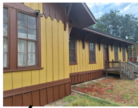
Lindsborg Union Pacific Train Depot (1879-1972) -New exterior paint