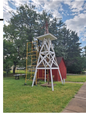
1908 Dempster No. 9 Windmill -In progress: Full restoration and repainting