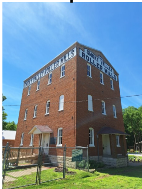
1898 Smoky Valley Roller Mills -Upper exterior masonry tuckpointing repair -Sign repainting -New parapet caps -New guttering -Parking lot regrading for drainage