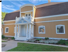
1904 World's Fair Swedish Pavilion -New front porch renovation -New exterior paint -New historically accurate windows Pending: Structural repair, new roof