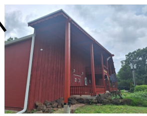
Main Museum Building -Repaired porch posts and supports -New guttering -New security system and cameras -New walkway to Old Mill Pending: Better ADA accessible sidewalk