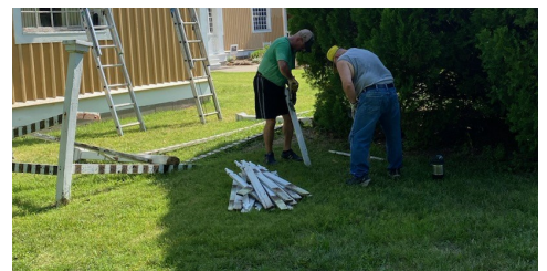
Volunteers with the Museum Handy Crew are repairing the Pavilion's historic re-creation fence.