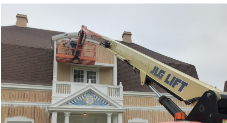
KenJax Painting is restoring the Swedish Pavilion's peeling paint across the entire building.

Page 4: Innovative New Ways to Experience the Museum