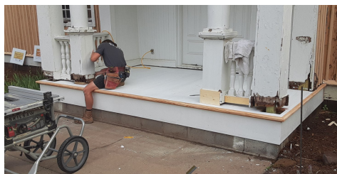
Workers with Kaufman Built reconstructed the crumbling Pavilion porch in time for Midsummer.