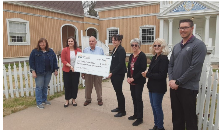
Representatives of the McPherson County Community Foundation, museum staff members, and museum board members accepted a Nutt grant in April.

Even more impressively, the Kansas Department of Commerce selected the museum to receive $250,000 from the State Park Revitalization and Investment in Notable Tourism (SPRINT) program - one of just 18 recipients out of 228 applications. Fewer than one out of 12 applicants were selected.